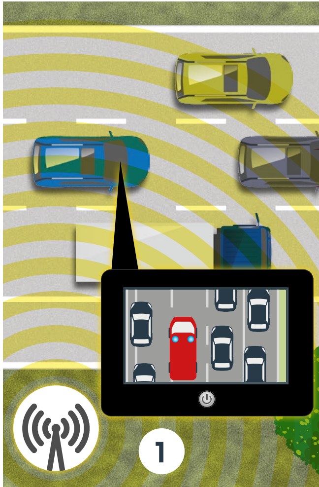
Driver is alerted to emergency vehicle approaching from behind, and shown how to get out of the way.